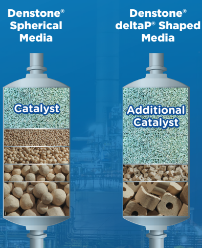
Typical support media loading configuration (not to scale).

More catalyst capacity delivers huge performance advantages through increased throughput, lifetime, rate and profits.